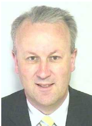
Benefits and Risks of the Use of Chlorine-containing Disinfectants Steve Crossley, The Food and Environment Research Agency, United Kingdom

Established methodologies for the assessment of human health risk to individual microbiological or chemical hazards in food are available. National food regulatory agencies have successfully applied these methodologies for a number of years and risk assessment methodologies have also been agreed internationally through the work of the Codex Alimentarius Commission.