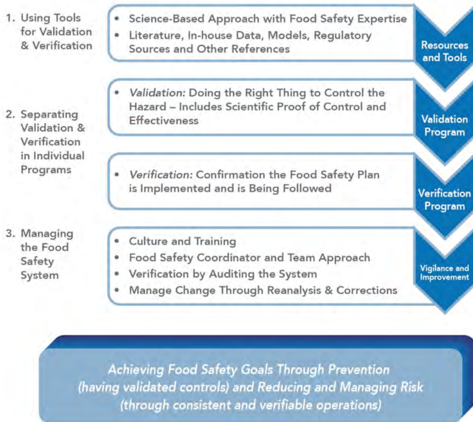
FIGURE 3. Framework for understanding and implementing FSMA validation and verification requirements

than 150 industry and academia participants that were captured in the Preventive Controls Summit 2013 during three breakout sessions. The framework focuses on the specific activities that are important to achieve FSMA food safety goals and to meet regulatory requirements. The approach presented here recommends: (1) use of science-based tools to construct effective controls for hazards, (2) consideration of validation and verification as separate programs, and (3) management of the food safety system with responsible and qualified staff who can recognize and adapt when change is needed.