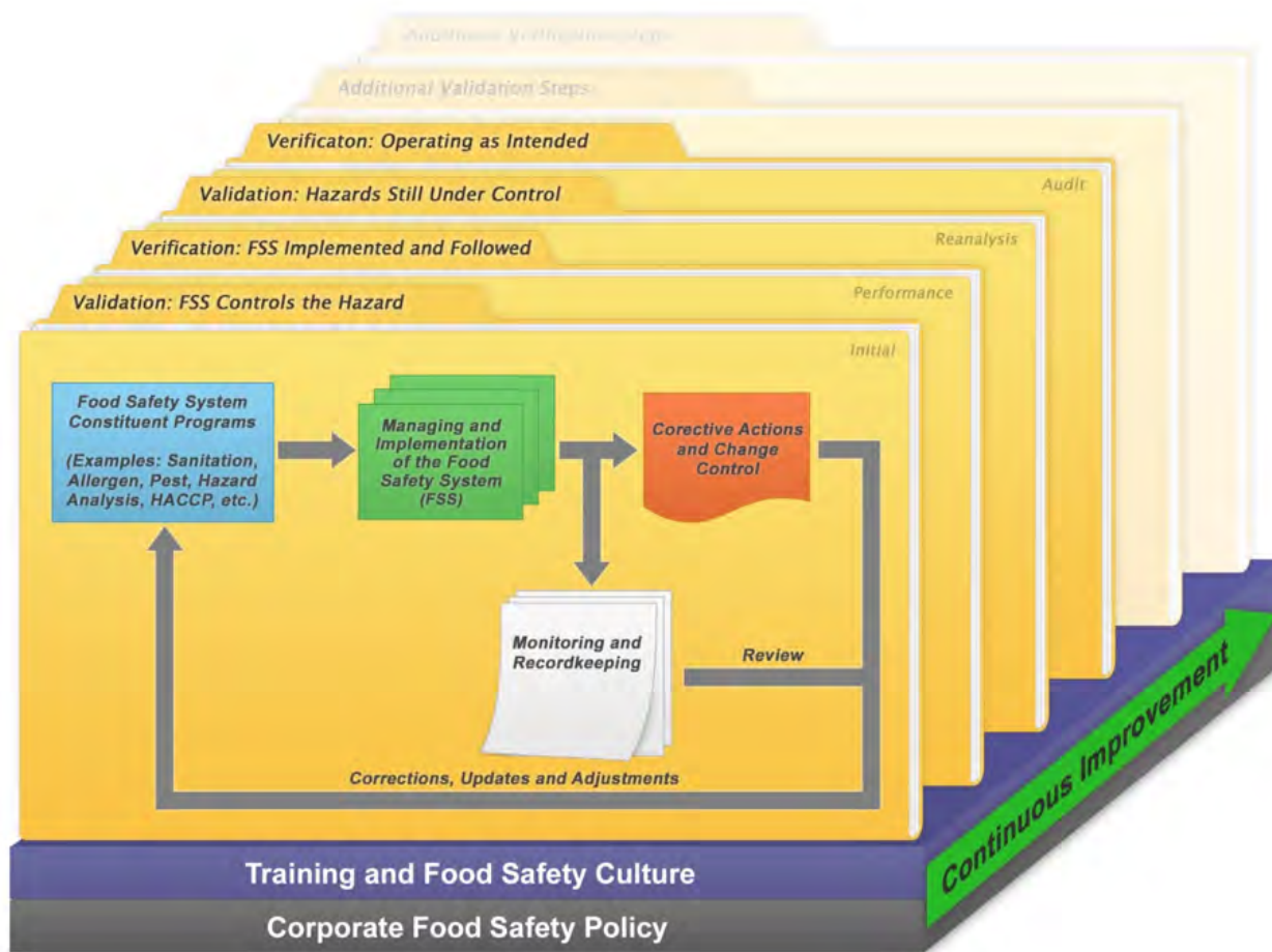
FIGURE 2. Validation and verification of the food safety management system

Validation consists of establishing and documenting the scientific evidence that food safety hazards are being effectively controlled through preventive means. That proof can come from a variety of sources (e.g., scientific literature, in-house studies, mathematical modeling, and regulatory resources). An "initial validation" takes place as the food safety system is being developed and during its initial implementation. The goal is to ensure that the food safety system is valid (i.e., actually works) for controlling food safety hazards associated with the operations, ingredients, process, and product. The importance of selecting and establishing the correct science-based procedures during the validation process