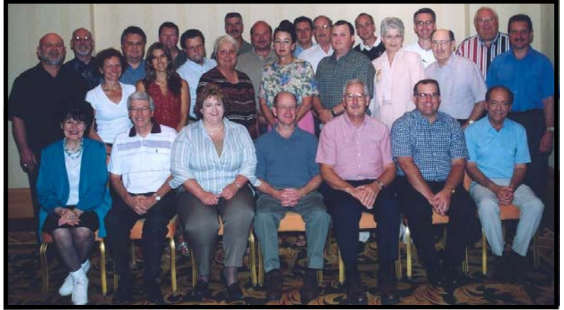
2004 Affiliate Council

Members Absent: Korea, Connecticut, Idaho, Iowa, Kansas, Mississippi, Tennessee, and Wyoming.