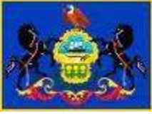
Affiliate Membership Achievement Pennsylvania Association of Milk, Food and Environmental Sanitarians

Each year, IAFP awards five of its Affiliates for efforts and achievements presented in their Annual Reports. Let IAFP recognize the work of your Affiliate. Plan to submit your Annual Report by February 16, 2010.