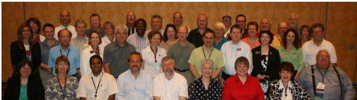
IAFP Affiliate Council meeting, July 2009.