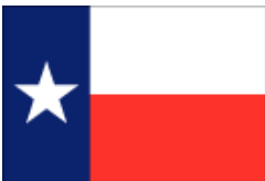
Best Affiliate Educational Texas Association for Food Protection