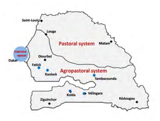
Figure 1. Dairy production system Senegal (19).

Senegal has a tropical hot and humid climate with a dry season from November to May and a rainy season from June to October (65). Variations in temperature and the frequency of extreme climate events directly affect livestock performance and welfare. They indirectly affect animals by changes in feed and grassland availability and