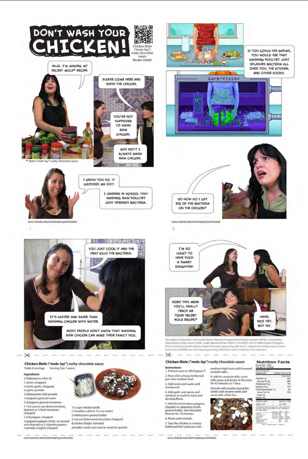
Figure 2. Don't Wash Your Chicken! Chicken Mole. One of Four Fotonovelas Developed Utilizing a Storyline to Teach Consumers Not to Wash Raw Poultry