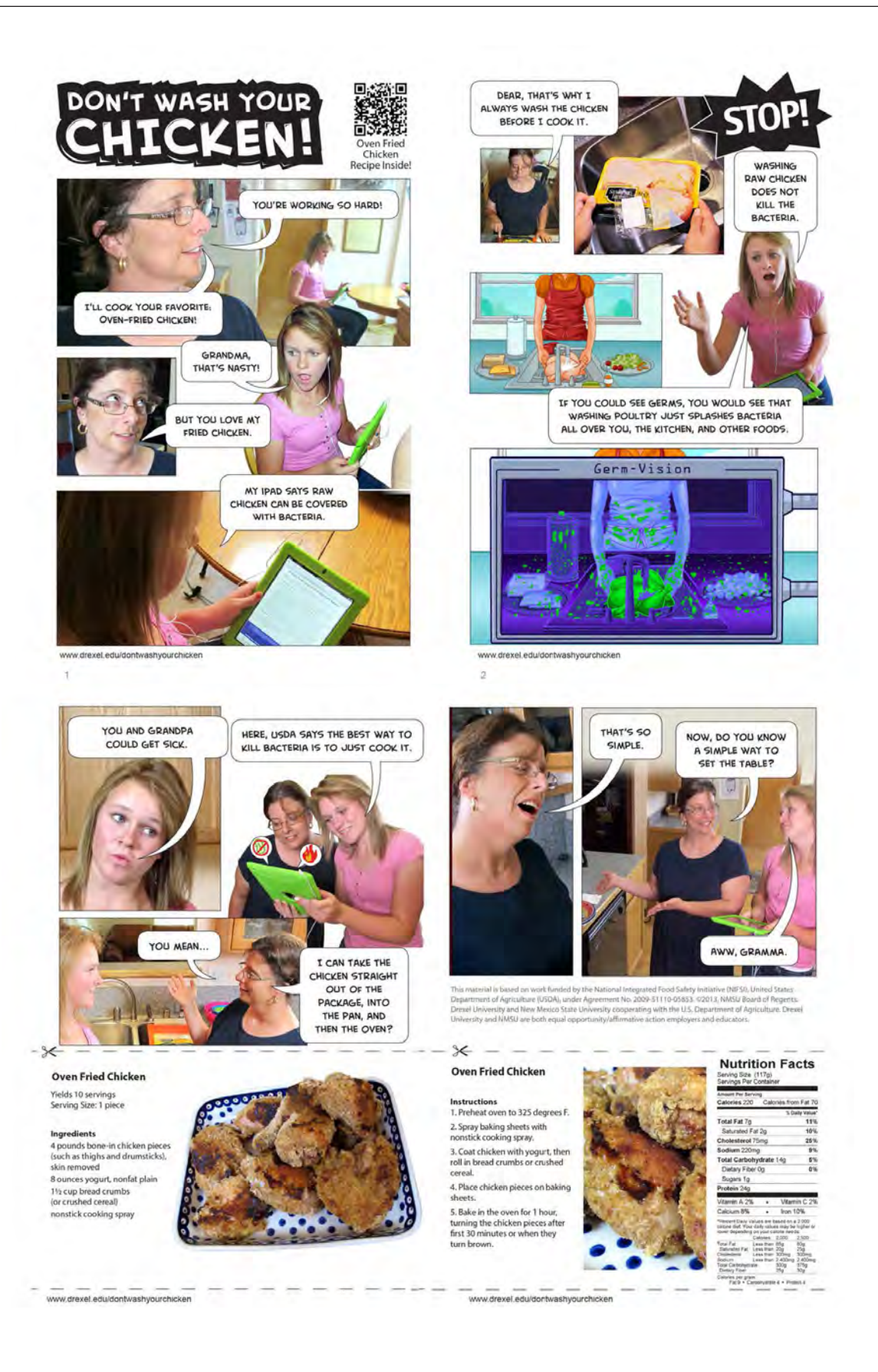
Figure 3. Don't Wash Your Chicken! Oven-Fried Chicken. One of Four Fotonovelas Developed Utilizing a Storyline to Teach Consumers Not to Wash Raw Poultry