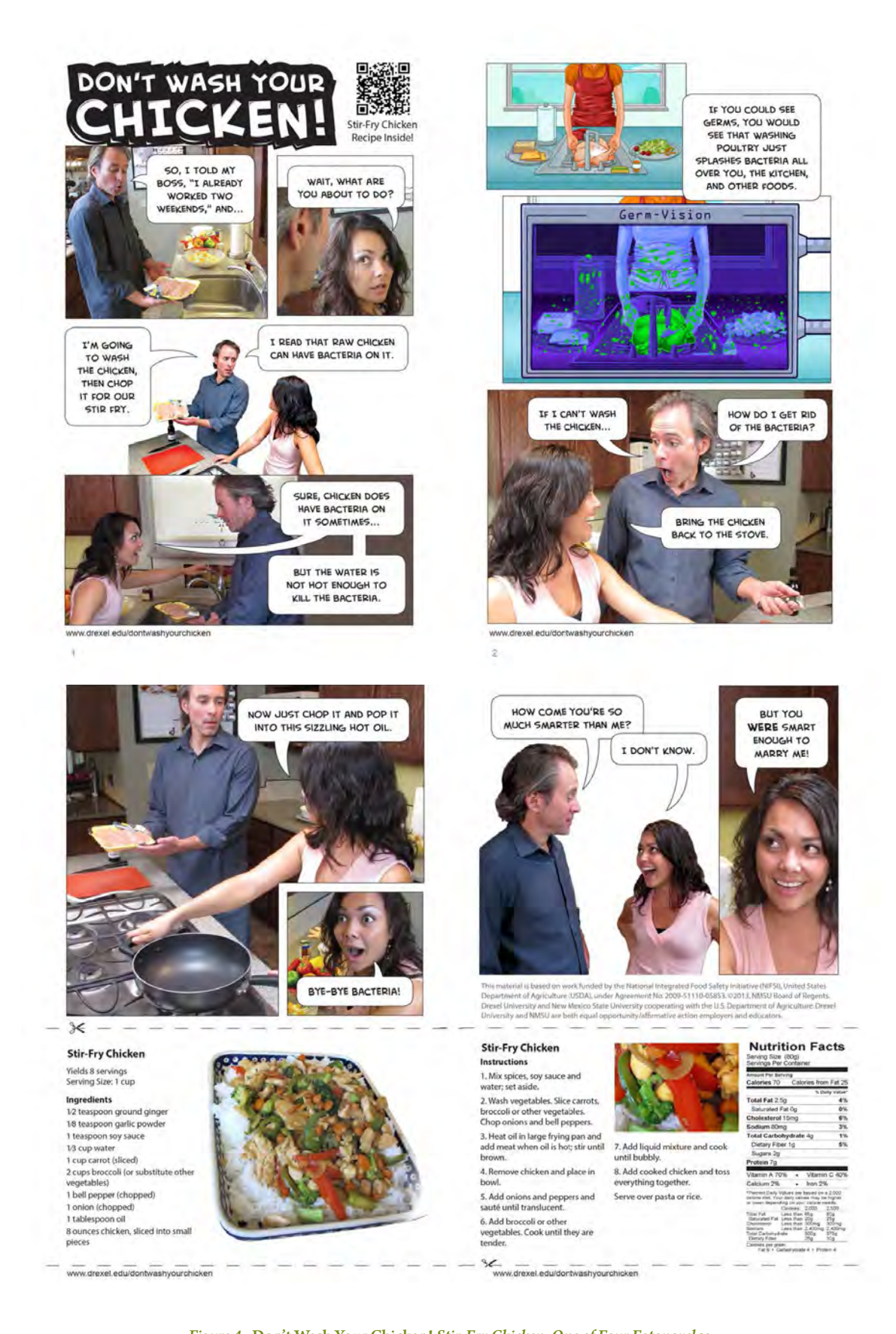
Figure 4. Don't Wash Your Chicken! Stir-Fry Chicken. One of Four Fotonovelas Developed Utilizing a Storyline to Teach Consumers Not to Wash Raw Poultry