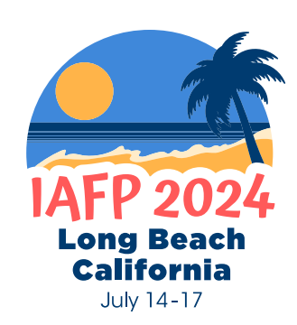
EXHIBIT HALL SCHEDULE