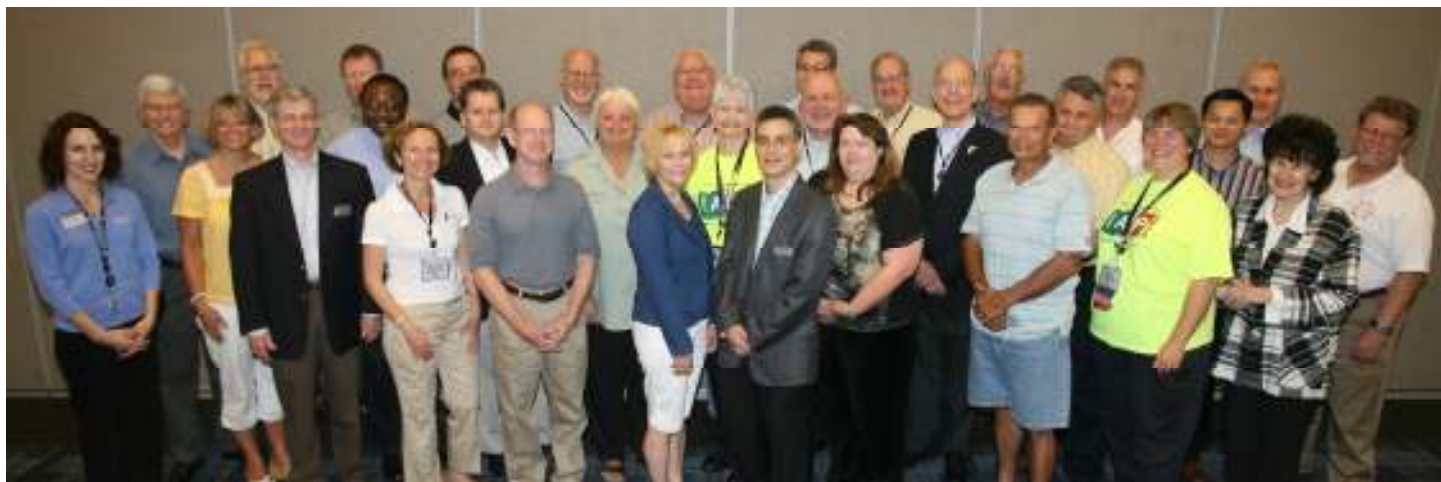
IAFP Affiliate Council Meeting, August 2008.