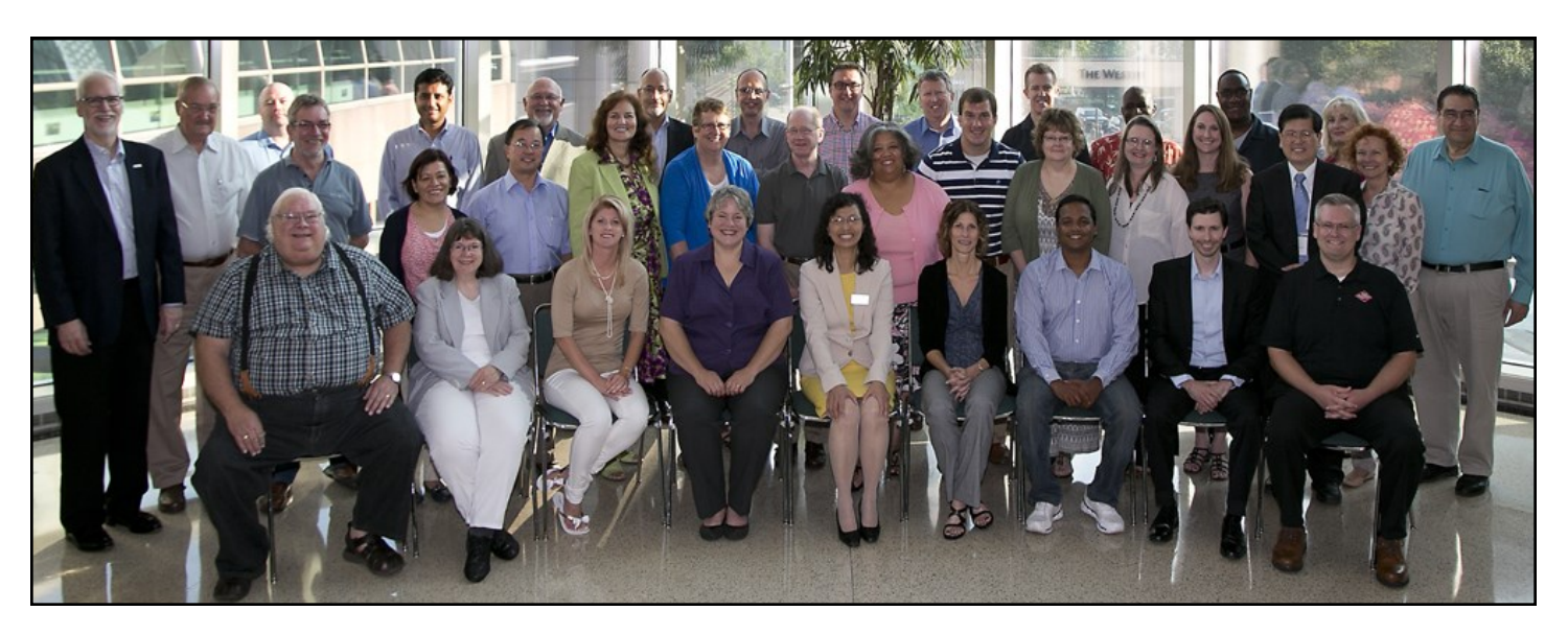
IAFP 2014 Affiliate Council Delegates

*Delegate is currently not an IAFP Member, as of April 10, 2015 (a requirement under IAFP Bylaws).